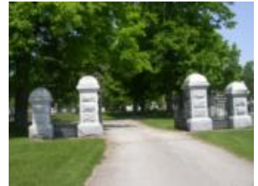
The Gates of Elmwood

The gates of Elmwood Cemetery are left open, to give an inviting and welcoming feeling to all who wish to use the cemetery's park-like setting. The cemetery has regular visitors, walkers and joggers passing through the gates every day of the week.